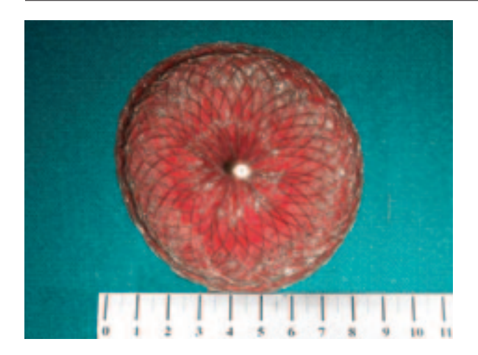
Figure 1. The Amplatzer device post retrieval.

surgical closure of the atrial septal defect. Various devices<sup>1-4</sup> for transcatheter closure are undergoing clinical trials, with each new device claiming advantages in terms of safety and efficacy over earlier ones. Amplatzer device closure of ASDs is preferable to surgical closure when the anatomy of the ASD is suitable. In patients experiencing unsatisfactory device position and significant residual defect, device retrieval is usually feasible at the time of implantation, followed by elective surgical closure. However, if embolisation (in which transcatheter snaring and retrieval is unsuccessful) occurs, urgent surgical therapy is necessary.<sup>5-8</sup>